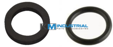
Outer Washer Inner O'ring