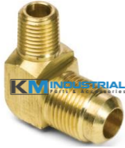
Male Flare Brass Elbow