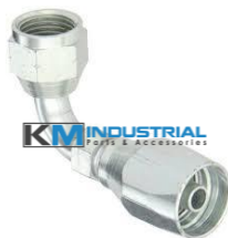
Hose End (90 Degree)