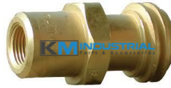
Male Gas Coupling REGO