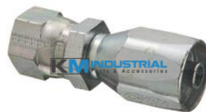
Hose End (Straight)