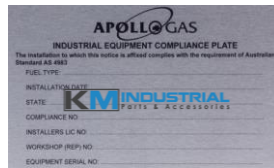
Gas Compliance Plate