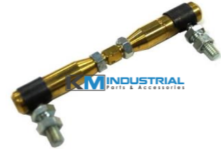
Adjustable Ball Joint Linkage