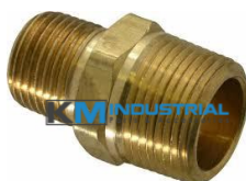
Brass Reducing Nipple