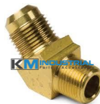
Brass Elbow Union