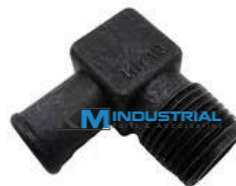
Nylon Elbow Fitting