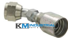
Hose End (45 Degree)