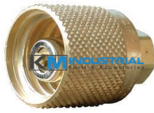
Female Gas Coupling REGO