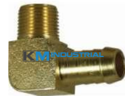
Brass Elbow Fitting